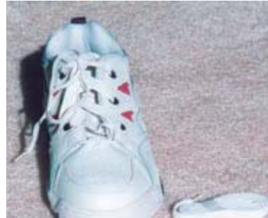
27" and 37" Shoelaces

JL509A 37" White JL509B 37" Light Tan JL509C 37" Light Navy JL509D 37" Light Grey JL509E 37" Black JL509F 37" Brown